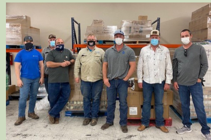
Mustang Fuel Corporation volunteers in McAlester.

In fiscal year 2020, the Southern Branch distributed 2.8 million pounds of food, including 598,000 pounds of